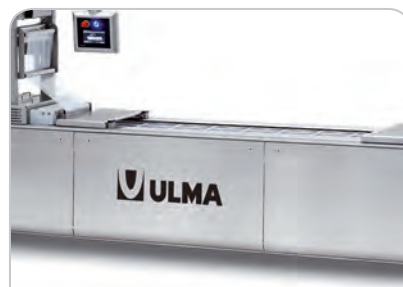
Optional longer machine 1000 mm. (39.4") (TFS 300)