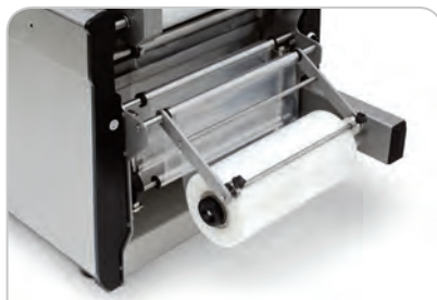
Pneumatic precision winding reel holder