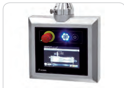
Friendly interface touch screen