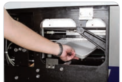
Easy Internal Access for Maintenance and Sanitation