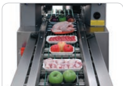
Automatic Tray Size Detection