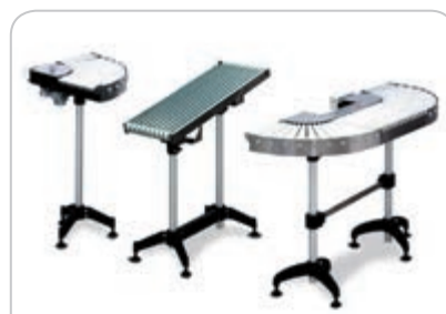
Gravity and Motorized Conveyors