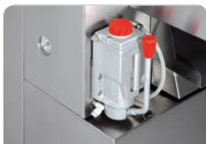
Centralized Lubrication System