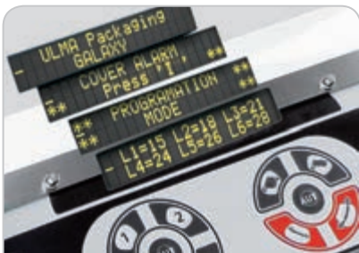
Easily programmable with diagnostic system