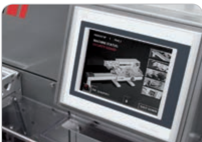
Industrial PC panel with color graphics