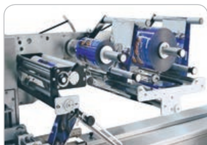
Double film roll holders with automatic roll splicing