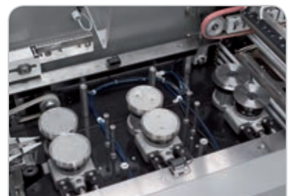
Longitudinal sealing system with tilting rollers