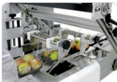
Adjustable film folding box