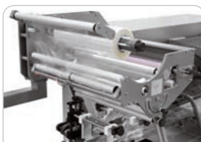
Pneumatic fastening reel holder and motorized film unwind