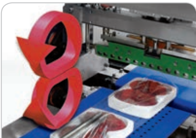
"Long Dwell" sealing head able to pack at highspeeds