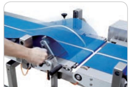
Easy feeding belt removing for cleaning