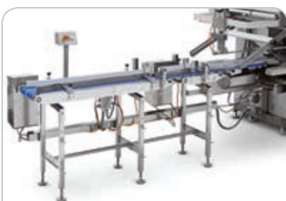
Automatic feeding conveyor